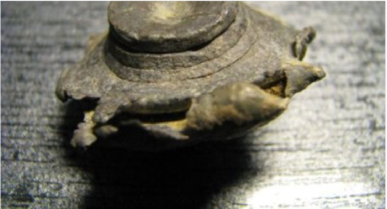
A bullet with a cracked tip and cracking spread.